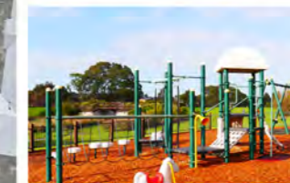
TYPICAL SMALL PLAY SPACE