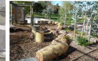
TYPICAL NATURE PLAY