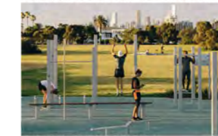
TYPICAL OUTDOOR GYM