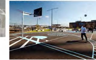
TYPICAL MULTI-PURPOSE HARD COURT