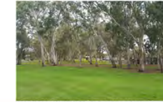
TYPICAL INFORMAL PARKLAND