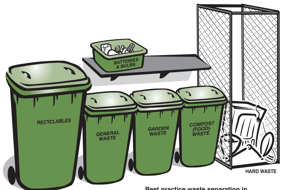
Best practice waste separation in multi-unit residential developments.

Construction sites can represent a great burden on local waterways. Site litter, paint, solvents, bricks, cleaning substances and clean-fill can all contaminate stormwater runoff. It is an offence under the Environment Protection Act to discharge contaminated water into the stormwater system. To avoid contamination, ensure that a drainage system is installed before construction activities commence and storm water is diverted from areas where soil is exposed.