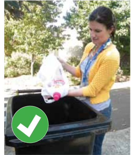
Remove recyclables from plastic bags before recycling