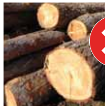
NO large logs or rubble