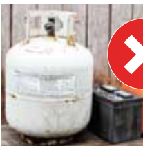
NO gas bottles