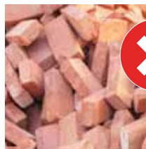
NO timber or bricks