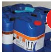
NO chemicals, paints or solvents