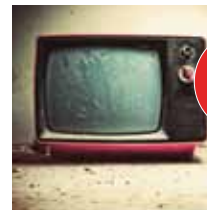
NO furniture or TV's