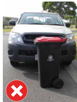
Do not place bins on the road, pathway or driveway.