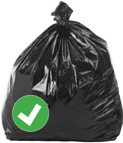
Bag your general waste