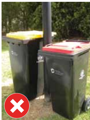
Power poles & lines.