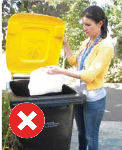
No plastic bags in recycling