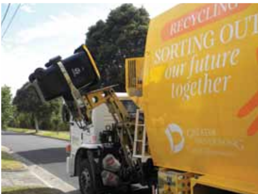
Mechanical arm can only lift 80kgs

Bins will not be collected if they weigh more than 80kgs.