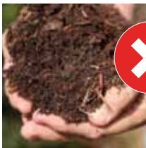
NO soil or rubble